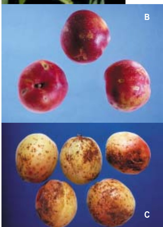
Figure 2. Peach (A), nectarine (B) and apricot (C) fruit with rust infections.