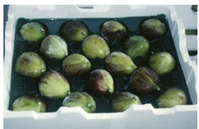
Figs packed for sale

The fruit should be cooled to 0°C as soon as possible. Optimum coolroom temperature is between –1°C and 0°C, with 90 to 95 per cent relative humidity. At 4.4°C to 6.1°C and 75 per cent relative humidity, figs will keep for eight days. The shelf life out of the cool store is only 1 or 2 days.