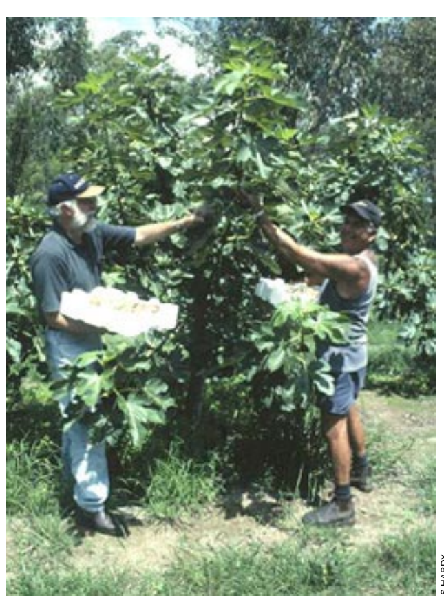
Picking figs into shallow trays for packing

be used for propagation. Orchard hygiene is important. Work on infected trees last so that the virus is not spread via sap on pruning tools. Clean tools thoroughly in a bleach solution.